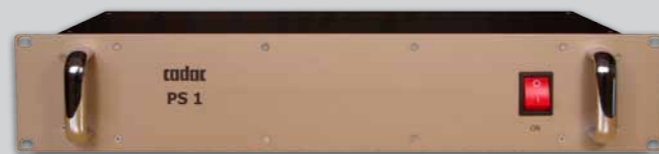
PS1 - Durable external power supply

All models will operate with incredibly low noise levels on all worldwide voltages.